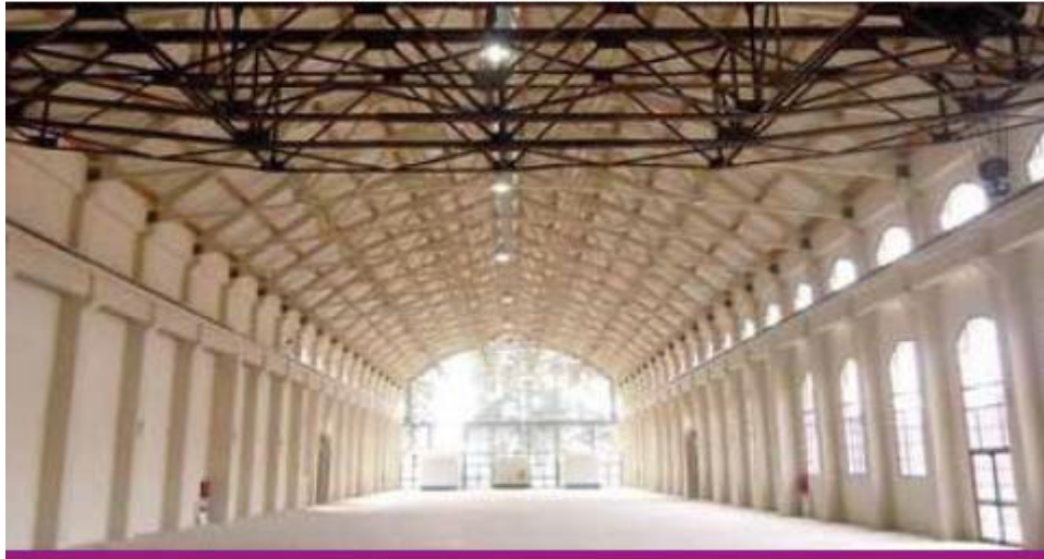
HEAD QUARTER EXHIBITION CENTER LA CATTEDRALE